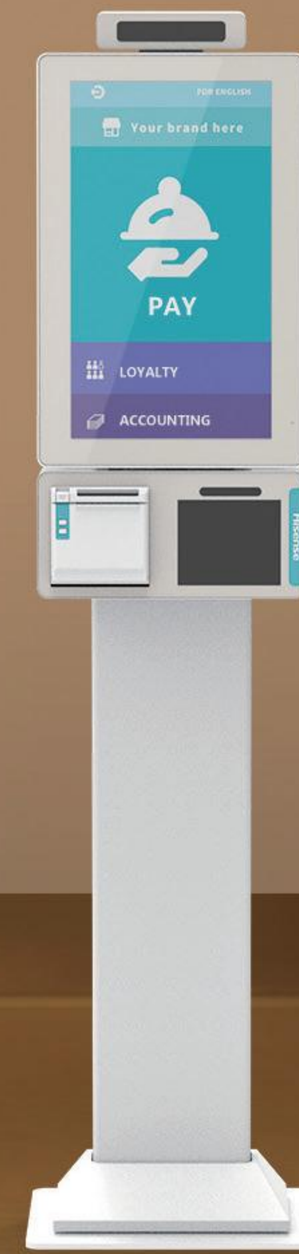
Host + Stand