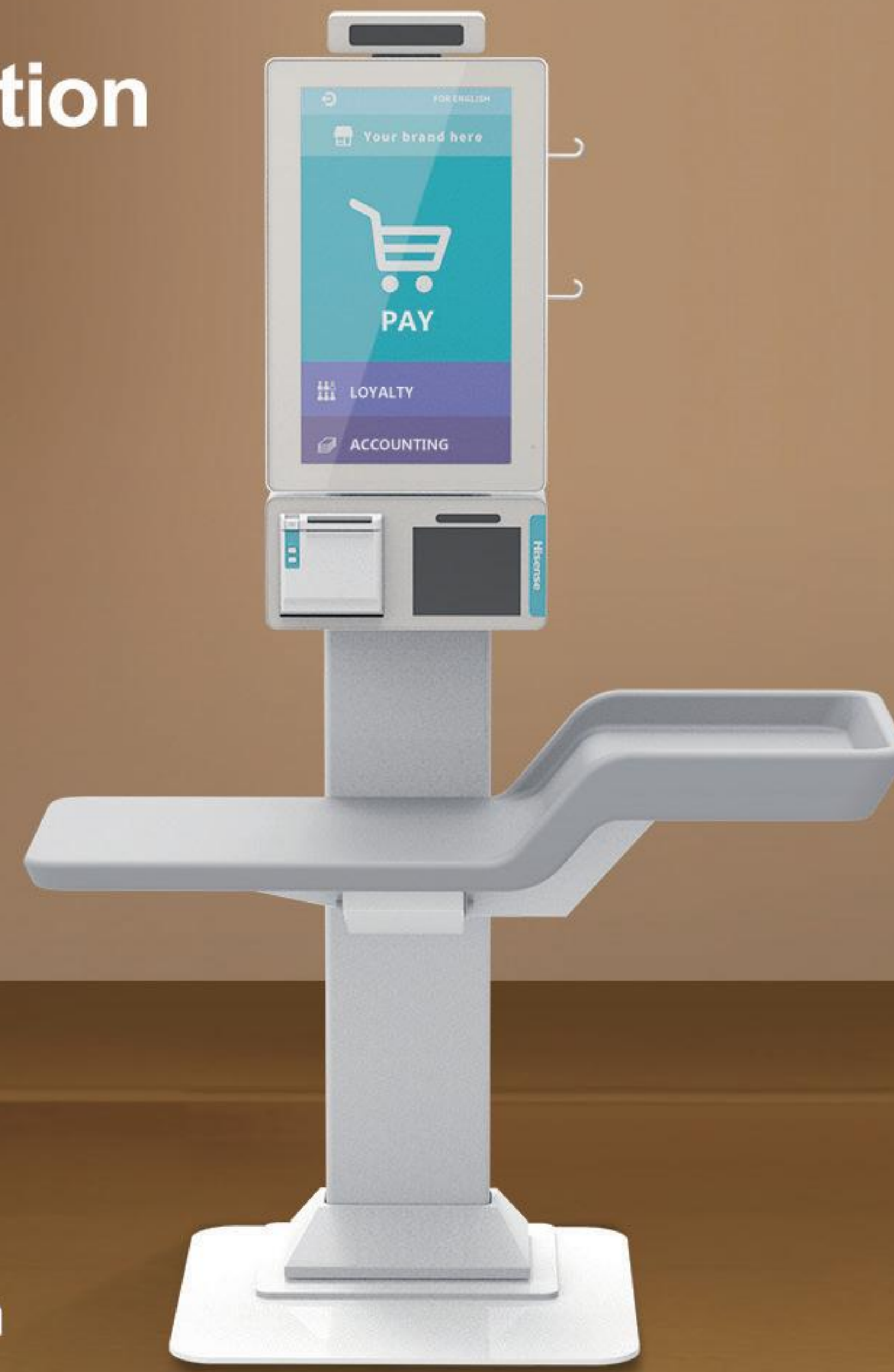
Host + Stand + Shelving platform